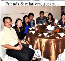
Friends & relatives, guests.....

Revive Band Chinese Choir Dialect Singers Skit performance Dancers