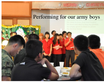
Performing for our army boys