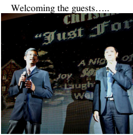
Welcoming the guests.....