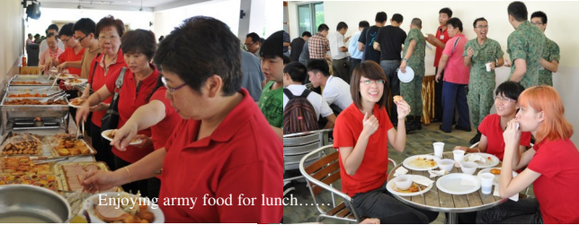
Enjoying army food for lunch.....