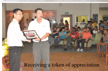
Receiving a token of appreciation